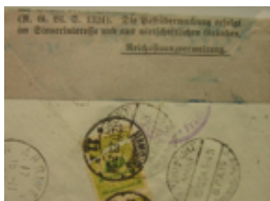
German stamp dating from around 1923, marked ten billion Reichmarks.

What is “hot” in the market for stamp collecting is China, and what is “not” is Elvis. These were among the insights shared on Monday, November 23, 2015 at an unusual ASA Chapter meeting. The program focused on the history and current market for stamp collections. Richard Colberg, AAA, one of the international authorities in this field, was visiting Chicago for a philatelic conference and kindly agreed to make a presentation to the Chicago Chapter. All attendees received an “error” stamp as well as a current auction catalog.